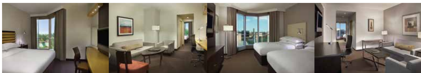
Standard Suite (King or Double) Bedroom and Living Room